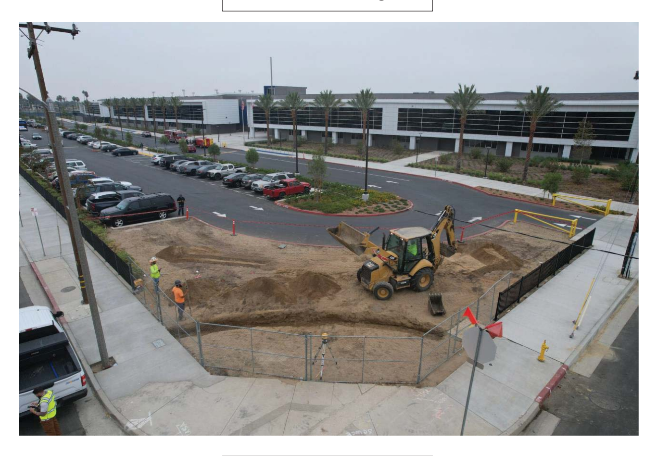
CHS Center Plaza Turf